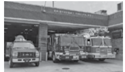
Good Will Fire Co. 304 Bush Street

Visit our department Facebook for new or changing events.